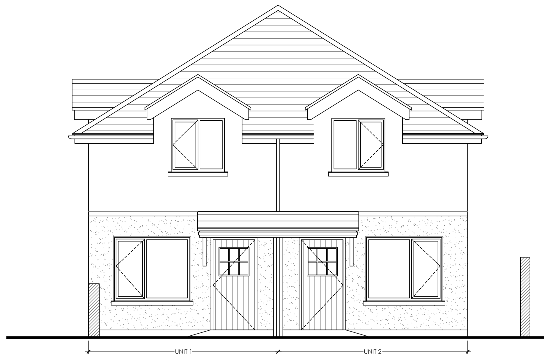
01 Front Elevation (North) scale: 1:50