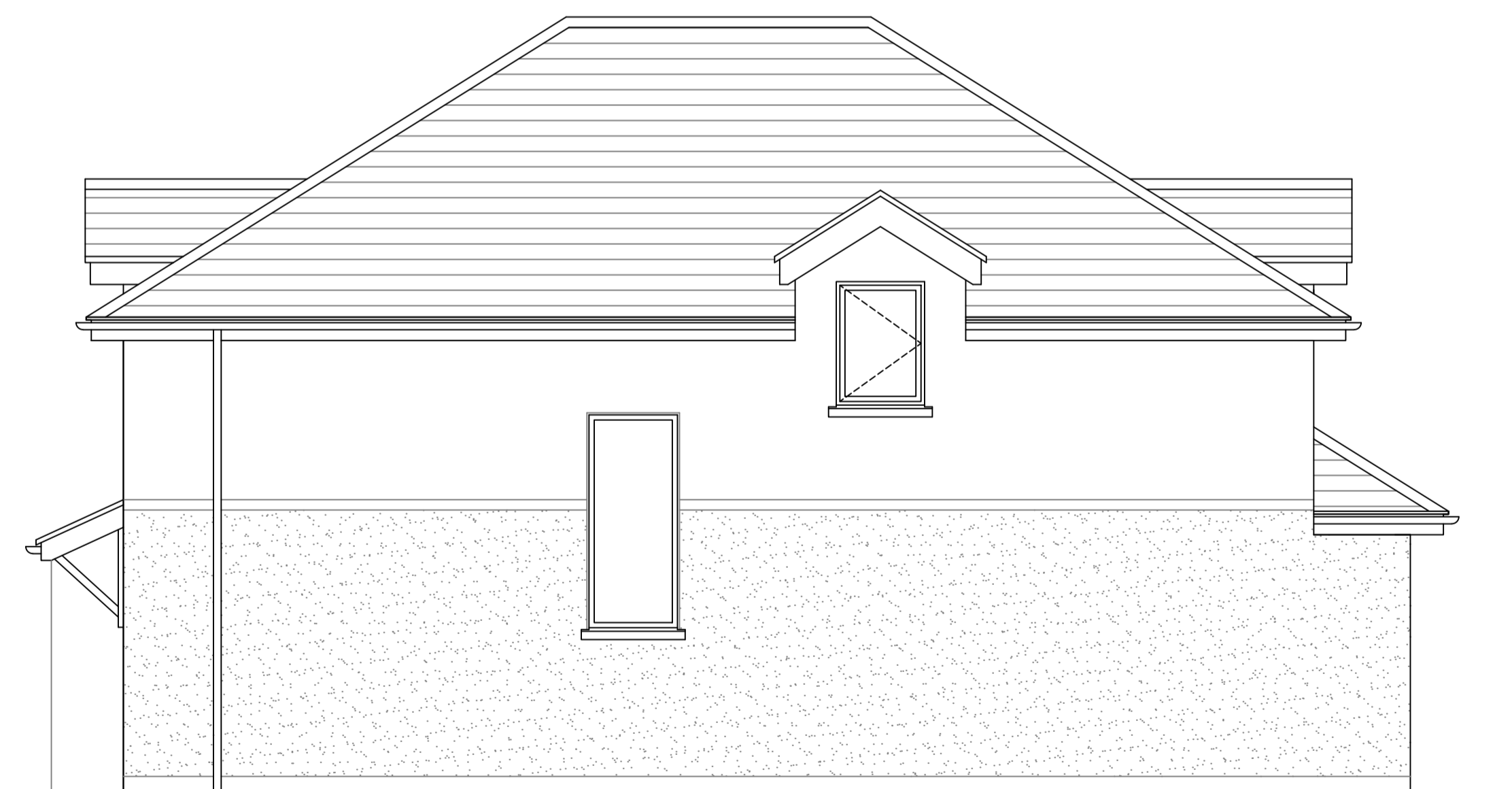
04 Side Elevation (West) scale: 1:50