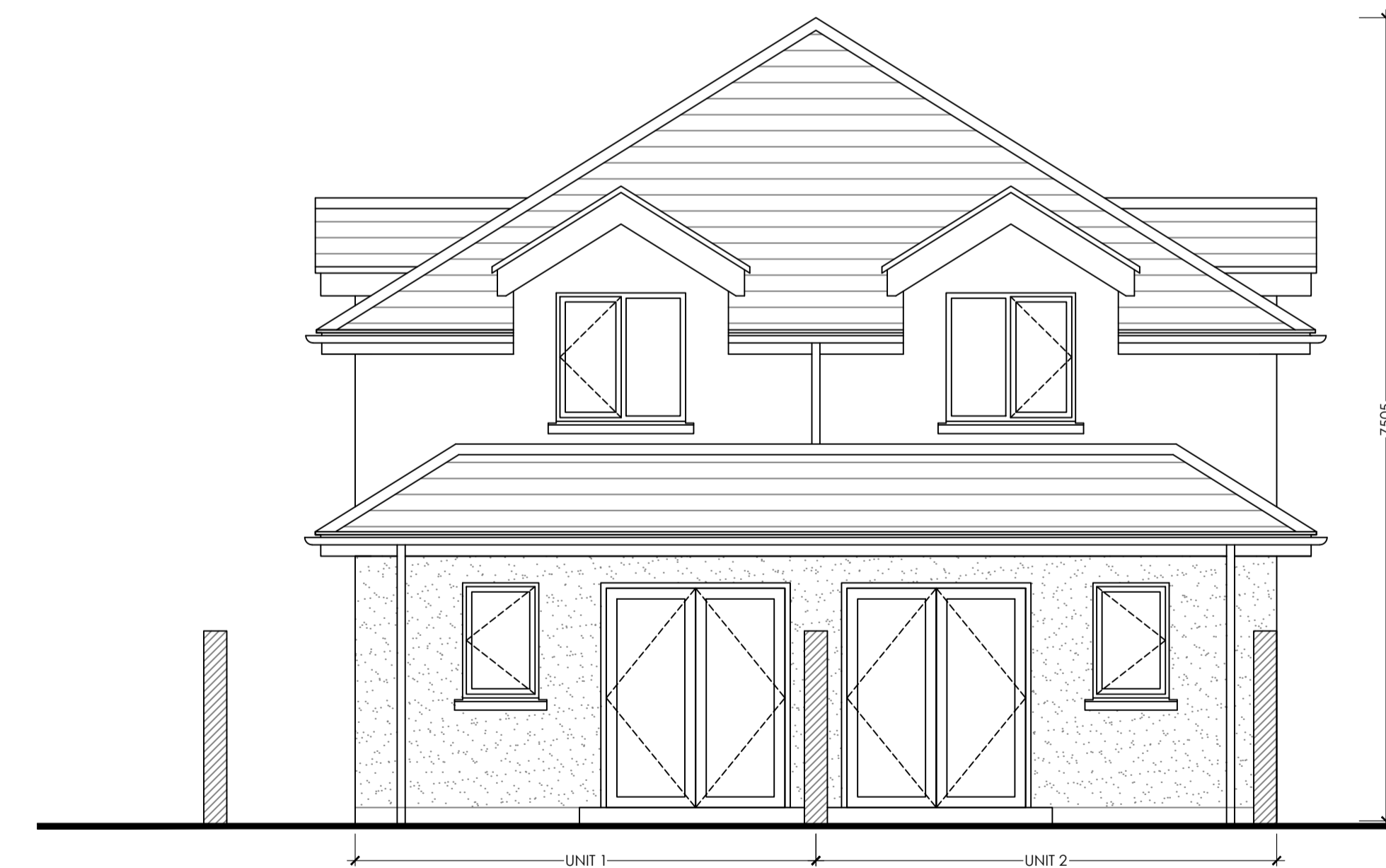
03 Rear Elevation (South) scale: 1:50