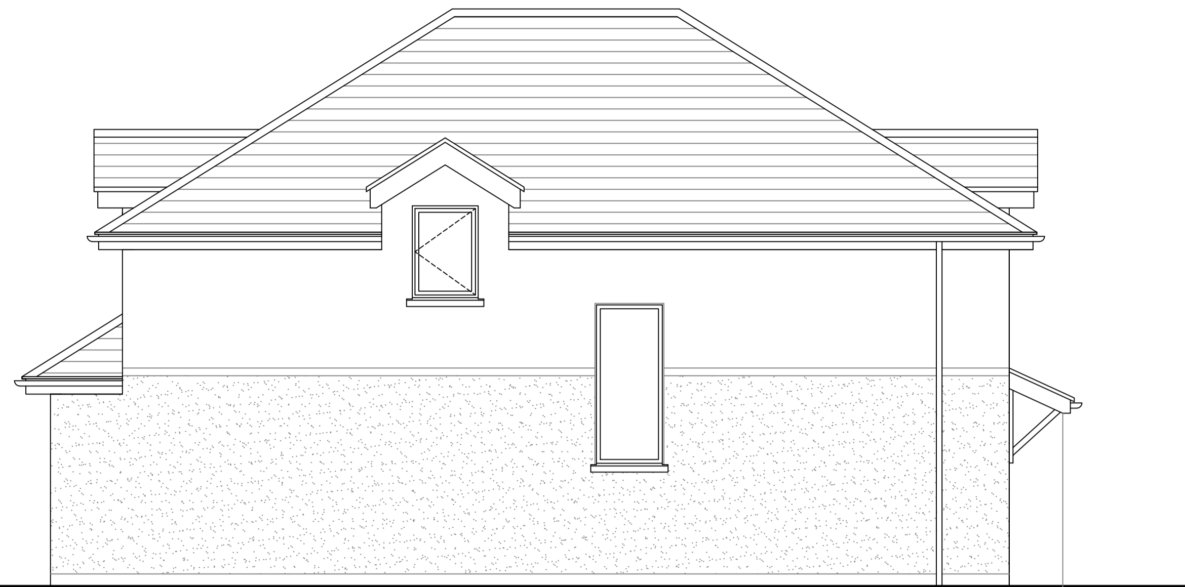
02 Side Elevation (East) scale: 1:50